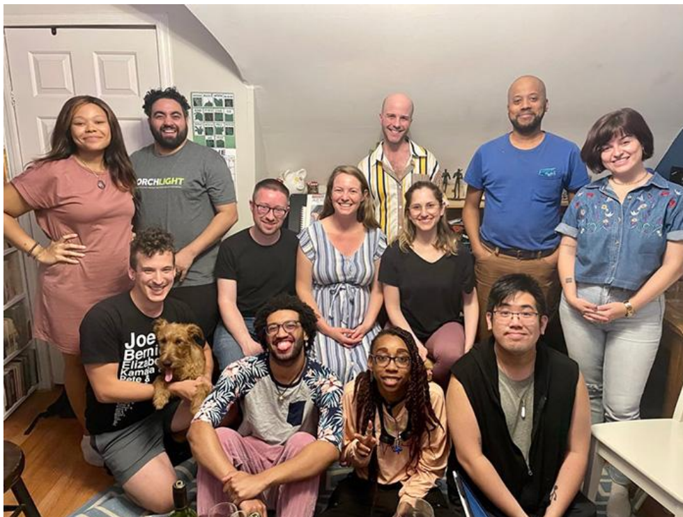
The team behind The Nobodies Who Were Everybody at the first reading for the August production